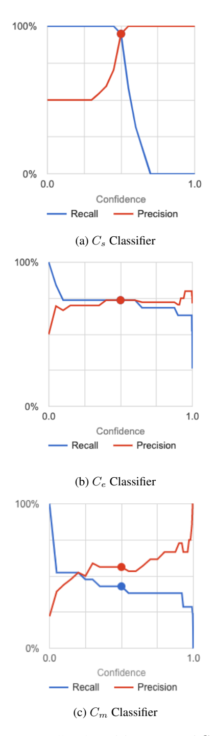
Figure 2: Recall and Precision Scores of C_s , C_e \& C_m Classifiers

<sup>4</sup>https://cloud.google.com/ natural-language/docs