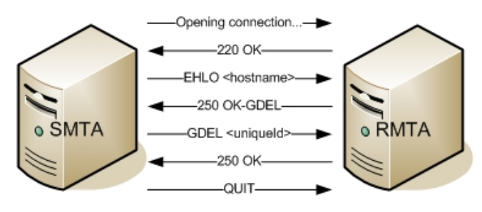
Figure 2: GDEL-command

It might occur that a RMTA gets a notification for an email that cannot be retrieved. The reason for that could be a temporarily unreachable sending host or a corrupted unique identifier for the message. In such a case the RMTA should try to retrieve the message a number of times (perhaps 3 to 5 times) over the next 48 hours. If retrieving the message continues to be unsuccessful the RMTA discards the notification and stops retrieving it. If the message to be retrieved was legitimate (and the non-delivery was just because of technical difficulties) there are mechanics to notify the sender that the delivery of the message was not successful, which works quite the same way as the classical SMTP.